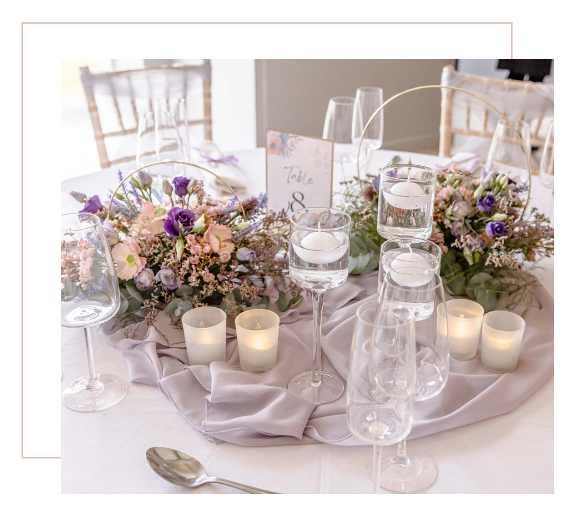
Table decor starting from as little as £30 per table